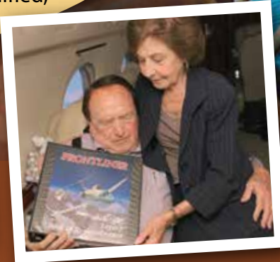
Mama and I are praying for our Partners from the Frontliner Legacy Book of Remembrance on our way to Tepic.

During the entire trip, tears flowed and healings manifested as the power of God swept through crowds of up to 10,000 people. This was not the result of simple theology, but the enduring power of a living message breathed forth from God.